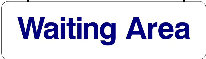
(BH) C1 - 7"x 24" Double Sided - Hanging - To Identify Area