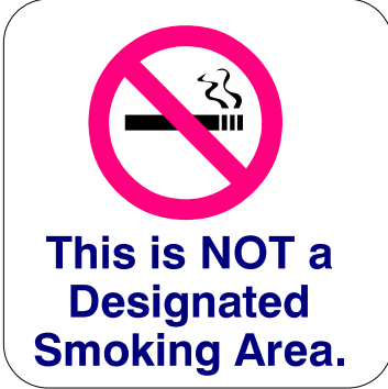
(BH) D9 -12"x 12" Door/Wall Mount - Instructional