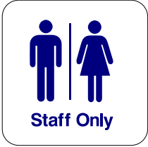
(BH) D1 -7"x 7" Door/Wall mount Washroom Symbol