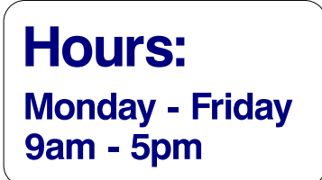
(BH) COW - 7"x 12" Wall/Door Mount Instructional/Directional