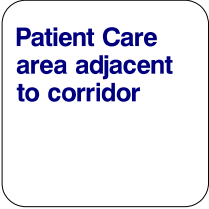
(BH) D1 -7"x 7" Door/Wall mount Service Room Secondary/Directional