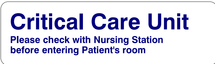
(BH) C1W - 7"x 24" Single Sided - Wall Mount Department Entry/ Instructional/ Secondary Directional