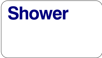
(BH) COW - 7"x 12" Wall/Door Mount Room I.D.