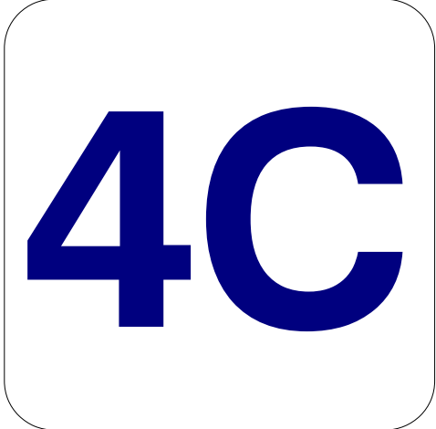
(BH) C2W - 16"x 16" Wall/Door Mount Ward Numbers