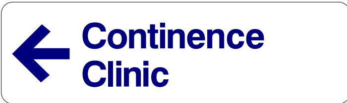
(BH) C1W - 7"x 24" Single Sided - Wall Mount - Directional